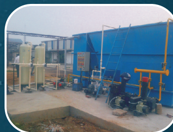
Sewage Treatment Plant